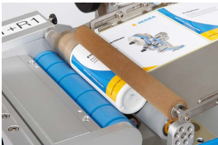
HERMA 211 with roller prism